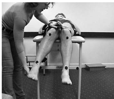
Figure 3 Measurement of hip internal rotation. The remote control is held by the examiner's left hand and the hip is passively internally rotated. The technique is reversed for analysis of the left leg.